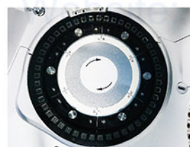
Reaction Tray 37±0.2°C, real-time monitor.