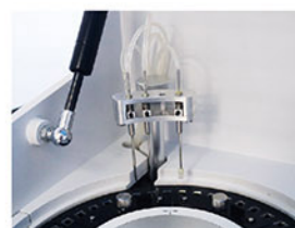
Washing Probe Independent 3 -step washing system.