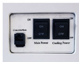
LAN Port Access