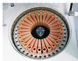
Reagent Tray Refrigerated tray with independent switch.