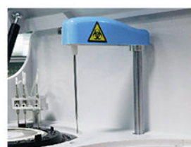
Sample Needle Liquid level sensor function. Anti-collision function. Reagent volume real-time detection.